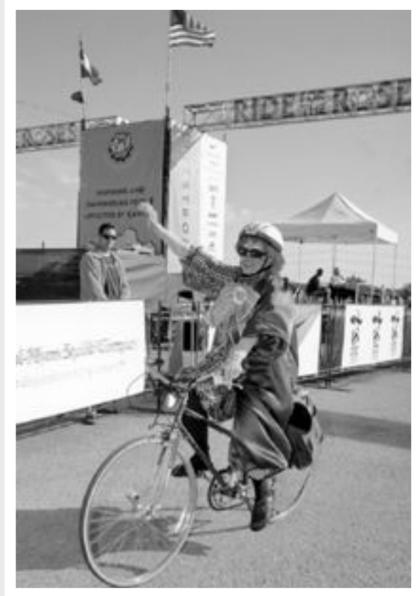
CAN-Do at the Lance Armstrong Foundation Ride for the Roses