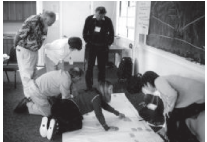
MBCW Board members join with other county and health experts to collaborate at a retreat held in the Marin Headlands.