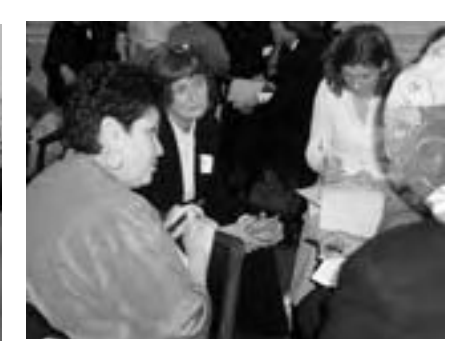
Overcoming barriers to participation in the center